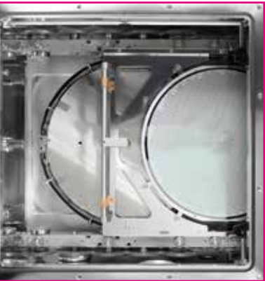
View into the process chamber of VADU 200XL-W.

The soldering systems of type VADU 200XL are equipped with two separate process chambers and can be operated with paste as well as preforms.