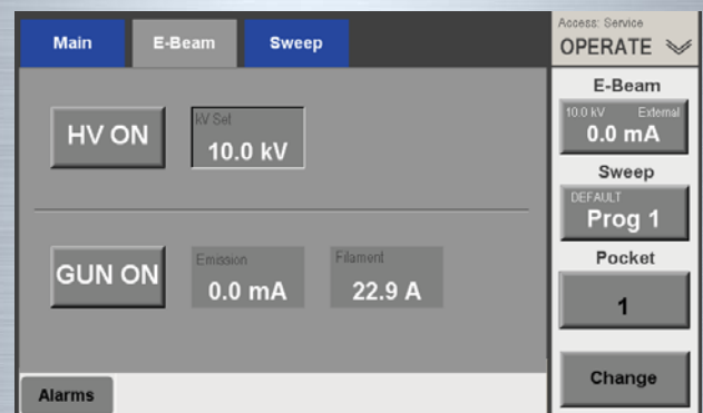
The EBC's Operations>E-Beam Screen

In evaporators without a PCL-based system controller, the TemEBeam EBC Integrated Controller provides the sole means of controlling the E-Beam power supply. In such systems, the EBC is therefore a required accessory for the CV-12SLX. Using the EBC's touch screen (see illustration below), the user can switch the e-beam on/off or switch the high voltage and the gun on and off independently of each other. The EBC also enables the user to set the kV and the emission power setpoints and to monitor the emission and filament currents in real time. The EBC can be configured to operate in stand-alone mode or in conjunction with single- and multilayer deposition controllers or PLC-based system controllers.